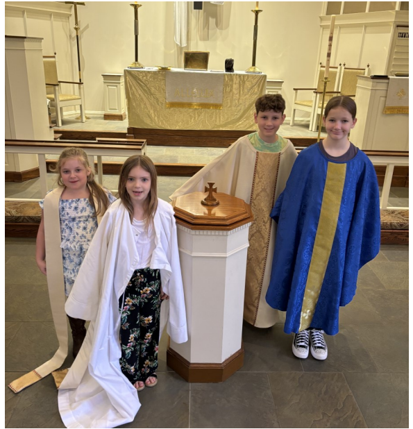
(First communion students try on vestments for worship)

Consider donating to our Youth Gathering Trip to New Orleans by taking a crown located in the narthex or scanning the QR code. Thank you!